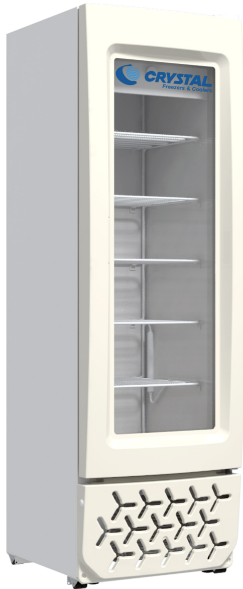
MIRA 570 x 649 x 1835 301lt