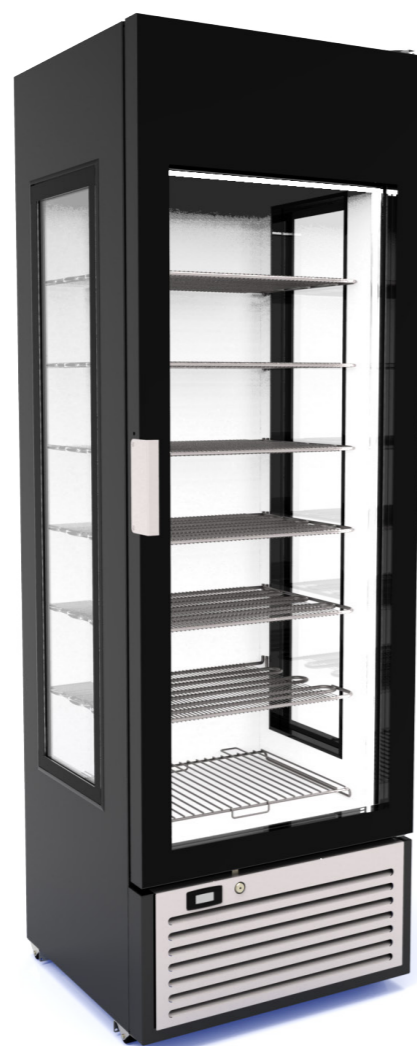
CRF 400 3D GLASS 667 x 620 x 2018 417 lt