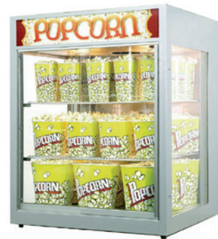
Table Top Display Warmer for pre-packed ready to eat popcorn

Displays multiple popcorn flavors. Adjustable temperature +30/+85°C Power – 700 W Voltage – 230 V Dimensions – 900x710x700 mm Weight – 55kg Model – VTP2-120 Code – 111080