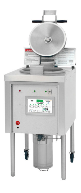
PF46 & PF56 COLLECTRAMATIC® HIGH EFFICIENCY FRYER

Ventilation required. Check local codes.