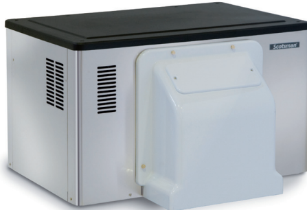
ABS Ice Chute Cover: sold separately.