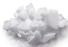
Residual water content 2%

Ice scales are the coldest form of ice. Formed at -6° to -12°Celsius, they are very dry, containing less than 2% residual water. Scales look like fragments of glass, have an irregular shape and a thickness that can be adjusted at 1 or 2 mm.