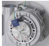
Gear box protection (hall effect)