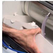
Easy to remove water sump