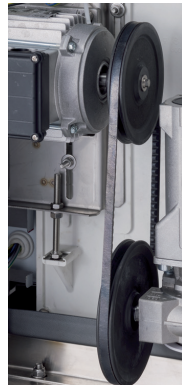
Pulleys & belt system allows to modify ice thickness