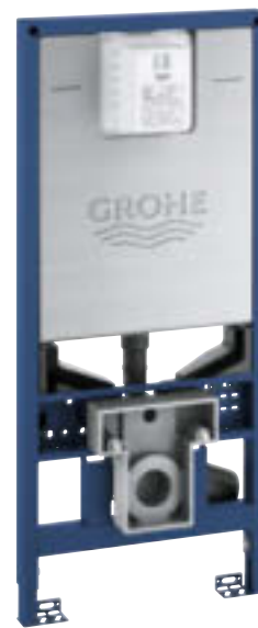
39 602 000 Rapid SLX WC 3-6 | 1.13 m US

Rapid SLX Element for WC, 1.13 m installation height with flushing cistern GD2, with electric socket, including flow manager, easy access. Including pipe-in-pipe connection.