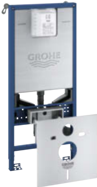
39 598 000 Rapid SLX 3in1 WC 6 | 1.13 m with wall brackets and noise protection

Rapid SLX Element for WC, 1.13 m installation height with flushing cistern GD2, with electric socket, including flow manager, easy access. Specifically for Saudi Arabia with different settings.