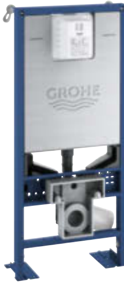
39 599 000 Rapid SLX WC 3-6 | 1.13 m F with heavy load feet

Rapid SLX Element for WC, 1.13 m installation height with flushing cistern GD2, with electric socket, including flow manager, easy access and fully insulated against condensation. Without outlet pipe.