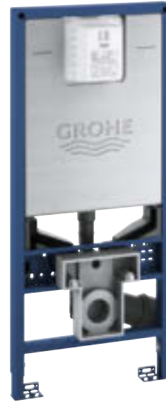
39 601 000 Rapid SLX WC 3-6 | 1.13 m, SASO

Rapid SLX Element for WC, 1.13 m installation height with flushing cistern GD2, with electric socket, including flow manager, easy access and fully insulated against condensation. With heavy load feet.