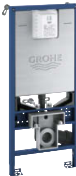
39 600 000 Rapid SLX WC 3-9 | 1.13 m SC Nordics adapter

Rapid SLX Element for WC, 1.13 m installation height with flushing cistern GD2, with electric socket, including flow manager, easy access and fully insulated against condensation. With wall brackets and noise protection.