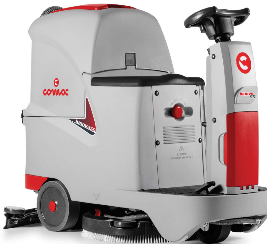
INNOVA 55 Scrubbing version with disc brush