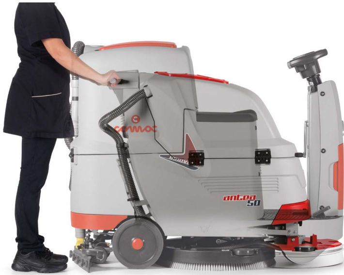
Small as a walk behind scrubbing machine productive and comfortable as an on board model.

The simple design and the new steering wheel make it ergonomic and handy in any situation