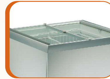
FLAT SLIDING GLASS LIDS