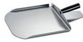
Guarded paddle with supporting side walls