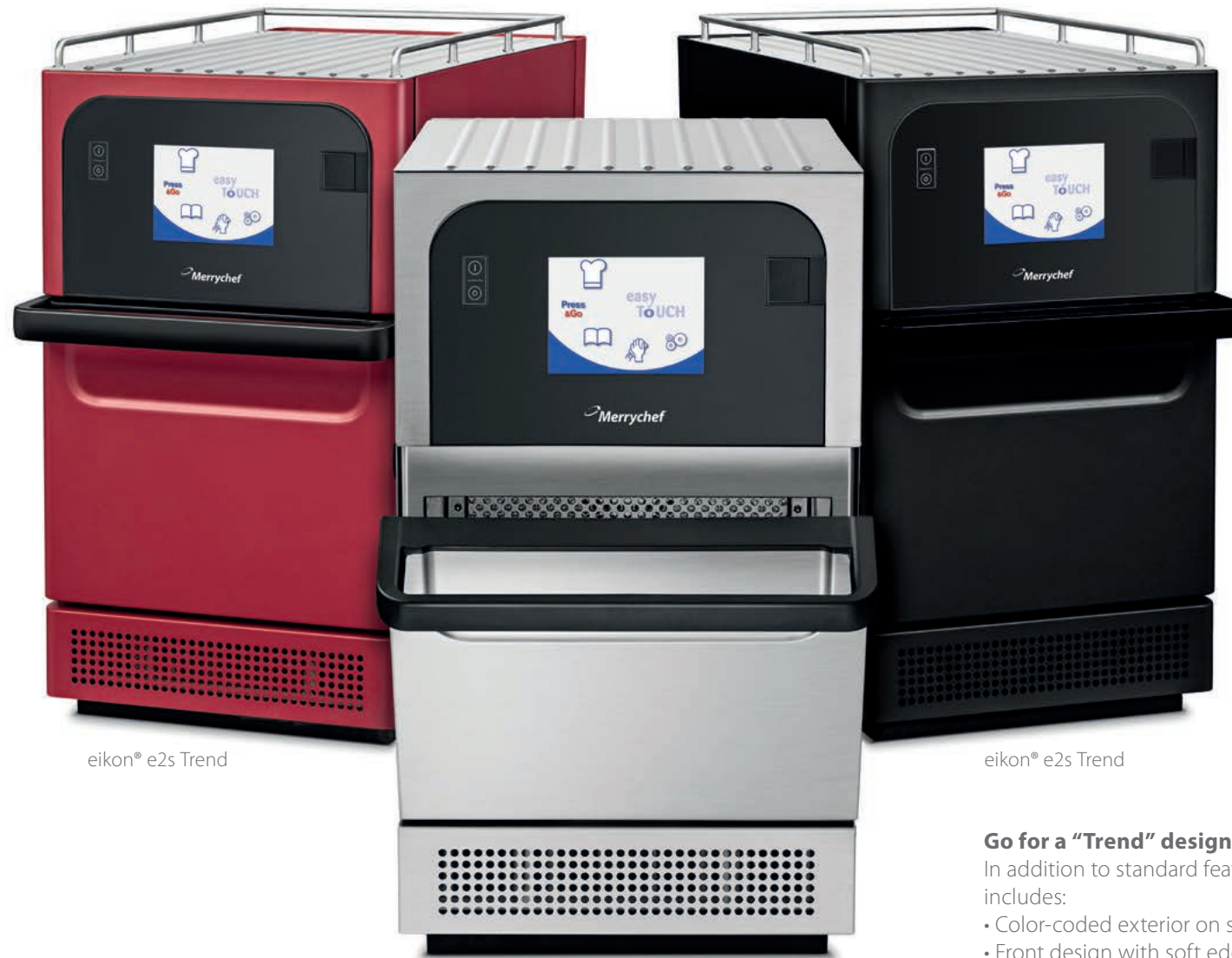
eikon® e2s Trend