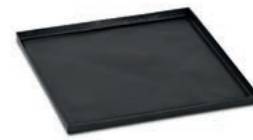
Solid base basket