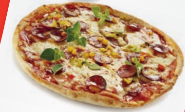
Pizza 50 sec.