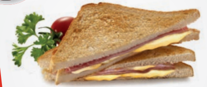
Toasted Sandwich 40 sec.