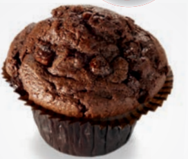
Reheated Muffin 30 sec.