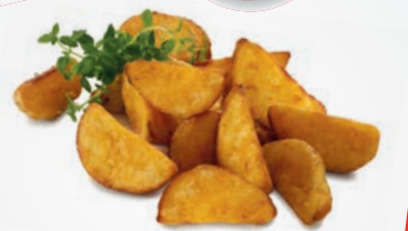
Wedges 60 sec.