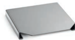
Flat cook plate