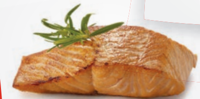
Salmon Steak 70 sec.