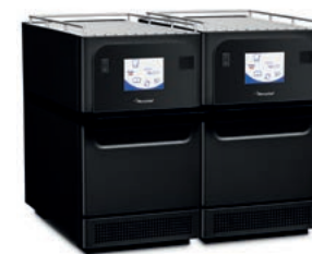
Adaptor for eikon® e2s Twin