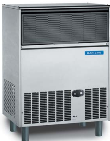
B 9040 AS/WS

Bar Line Equipment range is the newly released EU made ice makers for Thimble-shaped rounded ice cubes coming from Bar Line.